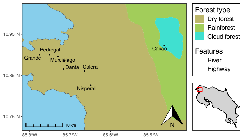
Figure 1 Study area and sampling sites for Craugastor ranoides across Área de Conservación de Guanacaste, Guanacaste, Costa Rica. Quebrada Grande (Grande); Río Pedregal (Pedregal); Río Murciélago (Murciélago); Quebrada La Danta (Danta), Río Nisperal (Nisperal); Río La Calera (Calera); Volcán Cacao (Cacao). Inset map shows the study area (red box) in the context of Costa Rican.

DNA was extracted from C. ranoides toepads using an ammonium acetate extraction protocol (Nicholls et al. , 2000). CO1 and 16S mitochondrial genes were amplified using the same primers and cycle settings as Crawford et al. (2010): CO1 using forward (F) 5'-GGTCAACAAATCATAAAGAYAT YGG-3' and reverse (R) 5'-TAAACTTCAGGGTGACCAAA RAAAYCA-3' primers, and 16S using F 5'-CGCCTGTTTAT-CAAAAACAT-3' and R 5'-CCGGTCTGAACTCAGATCA CGT-3 primers. PCR reactions for mitochondrial targets were carried out in a Techne Prime Thermal Cycler. We used total PCR reaction volumes of 20 µL, including 2 µL of the template DNA. The reaction mix included 2 µL Qiagen 10× buffer